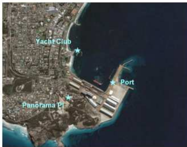
■ Figure 6-1 Location of TEOM monitoring stations between October 2007 and January 2008

Three TEOM monitoring sites were in operation during the period October 2007 to January 2008, and are shown in Figure 6-1. These continuous monitors provide 30-minute PM 10 concentrations.