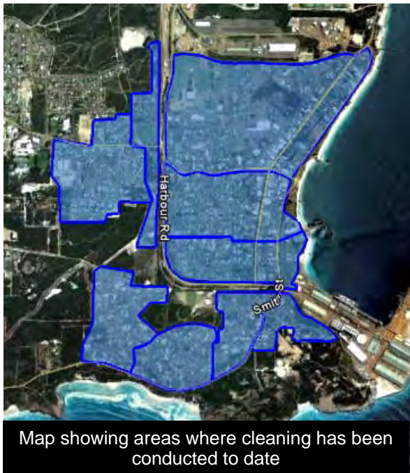
Map showing areas where cleaning has been conducted to date